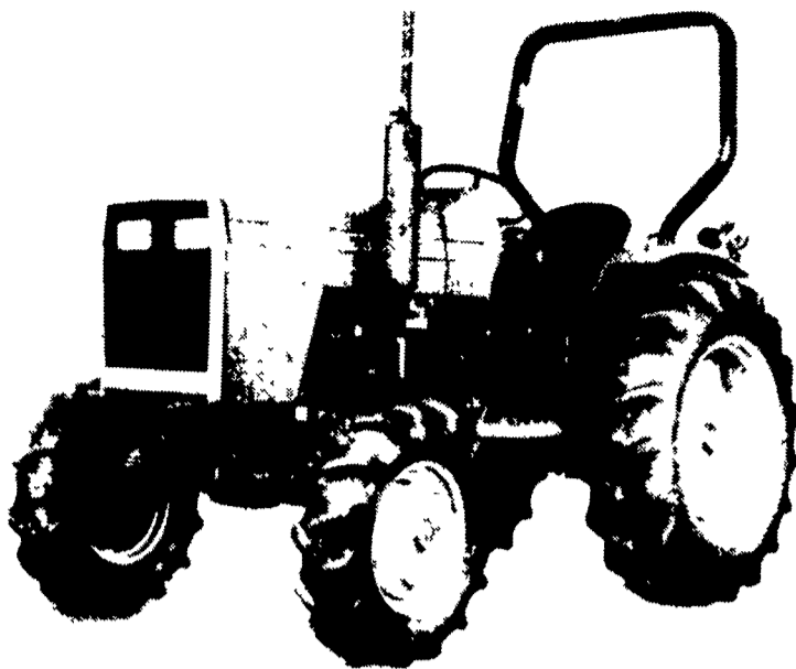
One of four new compact tractors from Massey-Ferguson, the M-F 1045 offers 35 engine horsepower and a nine-speed synchronized transmission.

Lift capacity for the Category I three-point hitch is 1,716 pounds. A position control lever raises, lowers and sets the three-point linkage at the desired position.