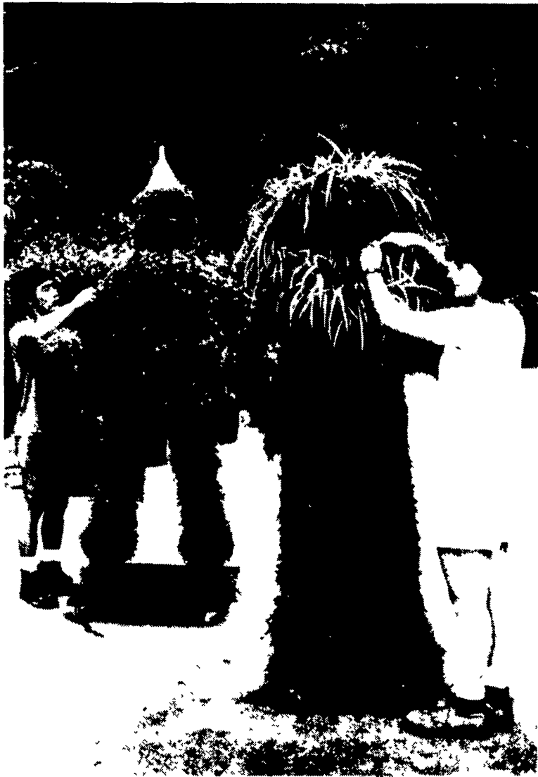
Gardeners at Longwood Gardens near Kennett Square have been patiently growing the Tin Woodman and the Cowardly Lion from plants. These and 16 other topiary favorite characters are in "The Wonderful Garden of Oz," the theme of this year's Chrysanthemum Festival.

and admission is $5 for adults, $1 for children ages 6 to 14, and free for children under age 6. To receive a complete listing of all events, send a self-addressed, stamped business envelope to: Chrysanthemum Festival, Longwood Gardens, PO Box 501, Kennett Square, PA 19348. For information, telephone 215-388-6741.