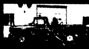
1979 4-wheel drive Ford F-150