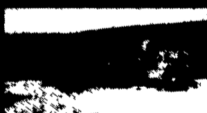
1971 Diamond Reo flat bed steel truck