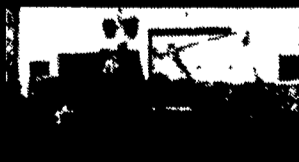
1971 Diamond Reo flat bed steel truck