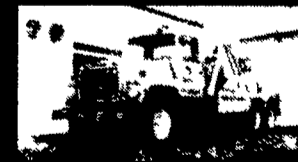
1953 Louisville Ford 10 wheeler tow truck

All Above Vehicles To Be Sold On Saturday