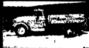
1958 GMC dump truck