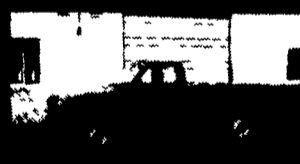
1983 1/2 ton Ford Ranger pick-up