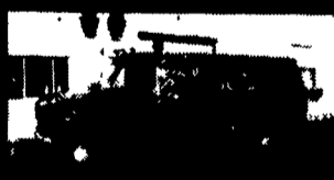
1976 Ford 250 Van