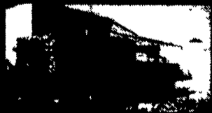
1948 Army 4 wheel dr. 900 x 20