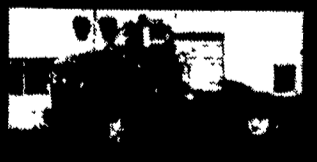
1963 GMC Tow Truck with removeable booms