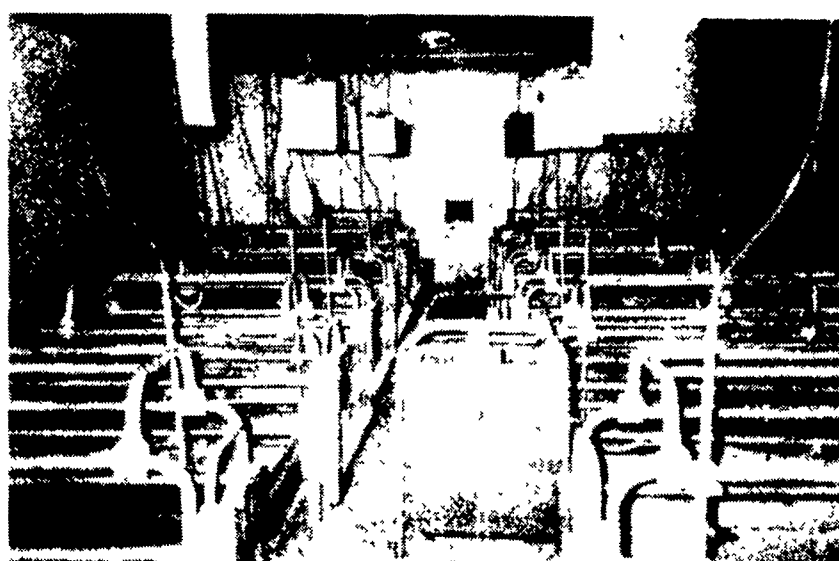
Hot Dipped Galvanized Extra Heavy Duty Farrowing Crates - Negative Winter Ventilation And Positive Summer Ventilation Designed For Energy Efficiency And Minimum Ammonia And Odor Levels.