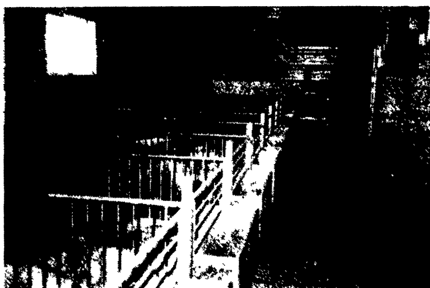
Extra Heavy Duty Hot Dipped Galvanized Nursery Fencing w/Heavy Duty Galvanized Round Bottom Feeders Designed For Minimum Feed Waste - Negative Winter And Positive Summer Ventilation Designed For Energy Efficiency And Minimum Ammonia And Odor Levels.