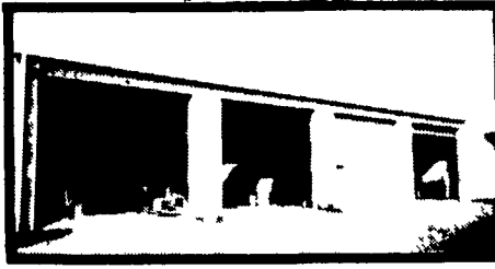
SHOP - STORAGE - GARAGE