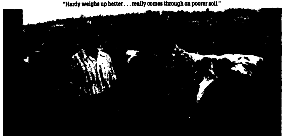
High yield technologies for today's progressive farmer.

You'll find our complete product line at dealerships throughout Pennsylvania, New York, Maryland, Delaware, Virginia, New Jersey, Ohio and much of New England