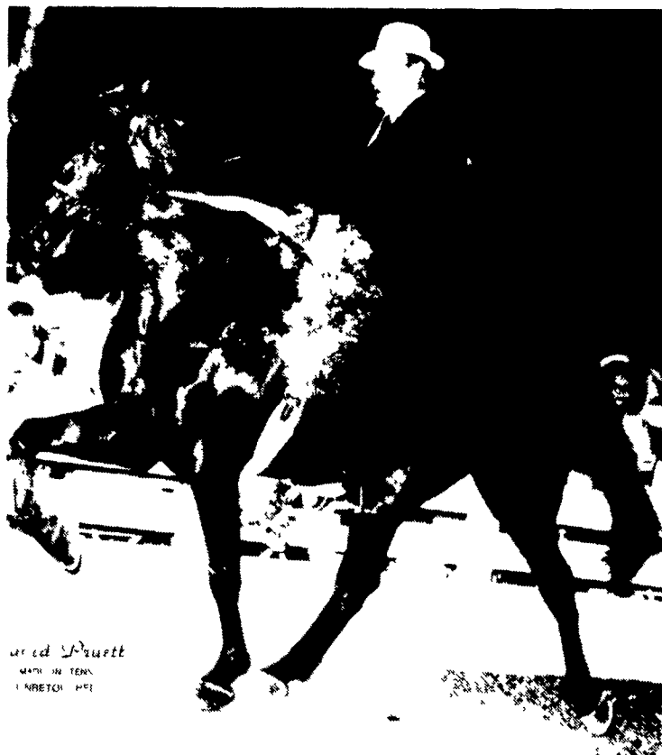
Raven's Touch MADE IN TENN. BRETON HSE