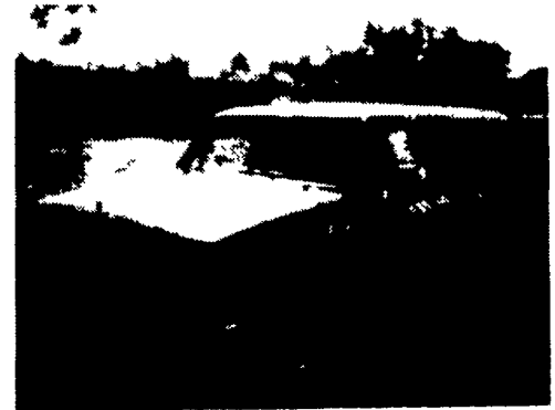
1986 GMC Suburban 2WD Diesel Station Wagon