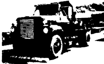
1977 IHC 2070-A, 671 Det., 10 Spd., 10' dump, Clean Truck . . . . $10,500

1982 GMC Top Kick 3208, 210 HP, 5 Speed Transmission, 2 Speed Rear, Air Brakes, 33,200 GVW, 20' Van Body, PS