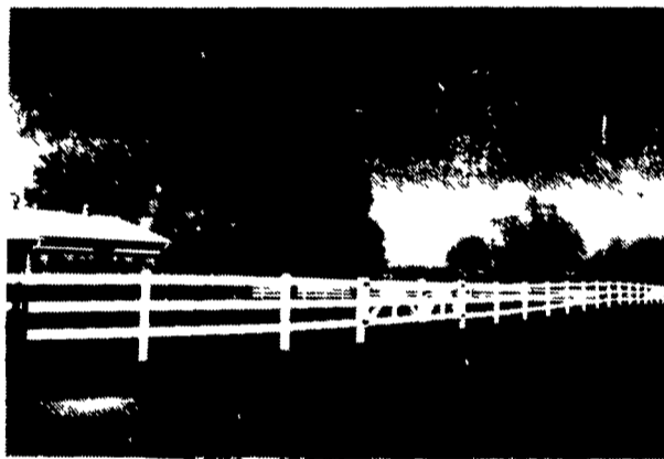
3-Rail Fence w/Gates "Never Need Paint" P.S. Polyvinyl will not rot, splinter, chip, etc.