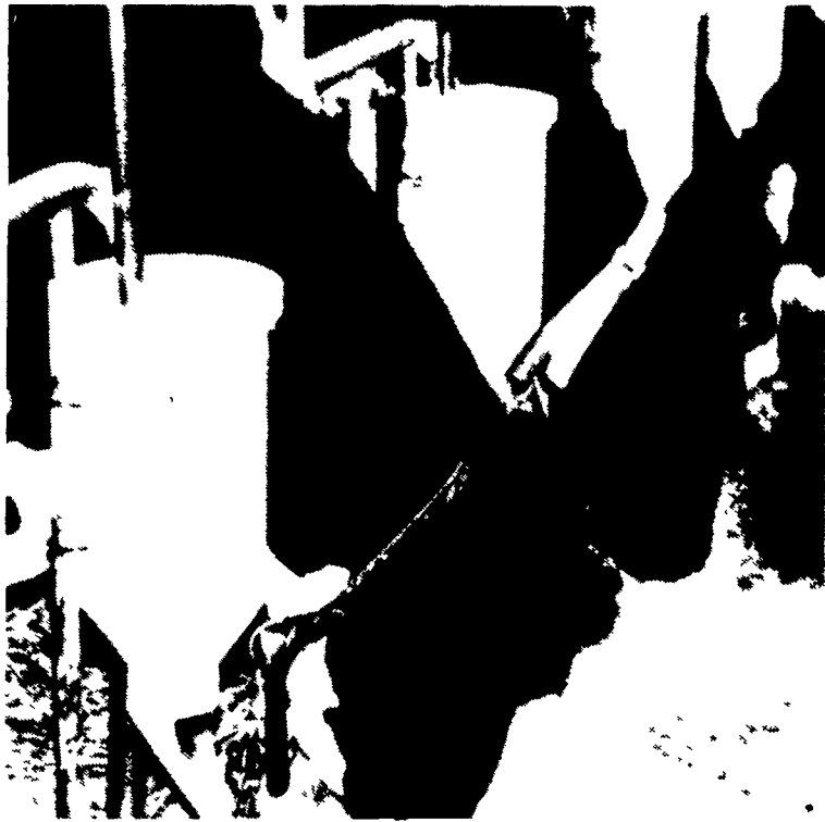
Starline's new multifeeder system eliminates the need for the farmer to be present in the barn for feeding several times during the day.

The breed registry guidelines will be available from Great Union in January, 1987. Breeding of fullblood "Salorn" cattle will require 3 more years. Great Union tests are being conducted at Dickinson Ranch, east of Colorado Springs, Colorado.