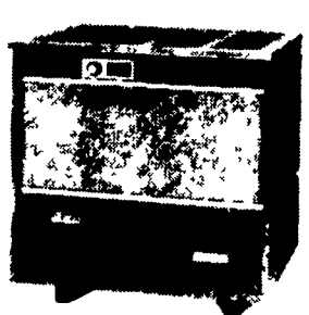
C-60D Wood Heater