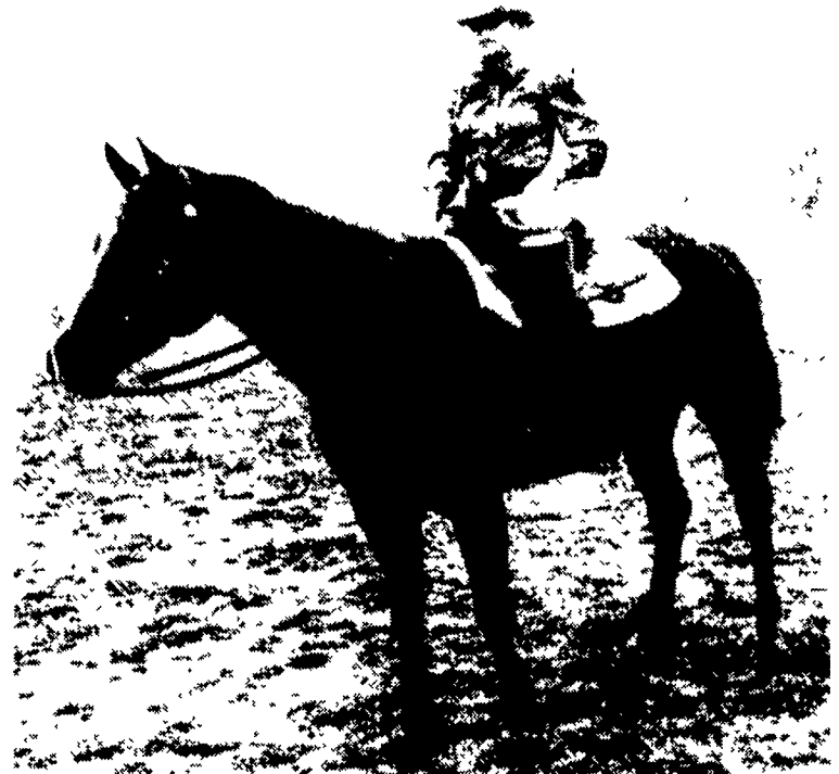
Delaware state 4-H horse show competitor Jean Staats is this year's winner of the Bea Campbell Trophy for high combined scores in showmanship and equitation.

A total of 31 4-H members entered the show. Proceeds from the show will be used to support 1986-87 Delaware 4-H horse activities.