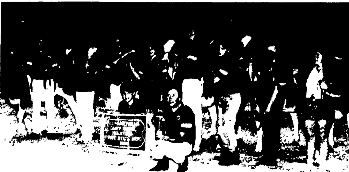
The New York state herd claimed the top prize in the state herd division with their best eight cows.