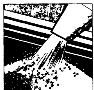
High yielding ability.