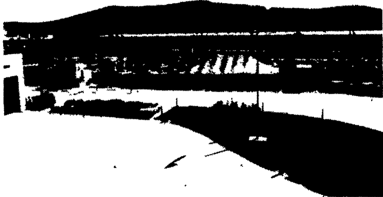
Over 1,000 members and guests attended an Open House held at Holly Milk Cooperative on Sept. 14.

Buy directly from the factory and save as much as $5,000 on sizes listed below