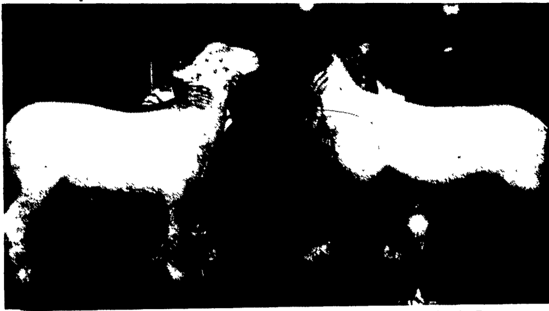
Grand champion market lamb honors of the Denver Fair went to Kevin Bollinger, right. Kevin Hoshour took the reserve position.

DENVER — The sheep show at the Denver Fair has grown to rival the Elizabethtown Fair for the distinction of the largest sheep show in Lancaster County. Nearly 100 showmen entered the third