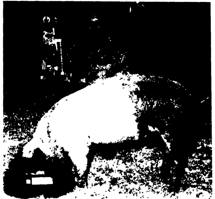
Reserve hog show honors went to Rob Rohrer of Nottingham.

1, 390-650 lbs. steers 58.50-68.50. One Lot Medium Frame No. 1, 590 lbs. bulls 60.00. CALVES 161. Few Choice 72.00-94.00, few Good 60.00-66.00, Standard and Good 70-100 lbs. 40.00-46.00, Utility 50-75 lbs. 30.00-35.00. Farm Calves: Holstein bulls 90-130 lbs. 50.00-85.00. Few Beef Cross bulls and heifers 85-100 lbs. 87.00-100.00. HOGS 405. Barrows and gilts $1 lower. Few US No. 1-2 225-240 lbs. 61.75-63.25, 1-3 215-245 lbs. 58.50-60.50, 2-4 235-275 lbs. 56.50-58.50. US No. 1-3 250-400 lbs. sows 51.50-53.50, 400-700 lbs. 53.00-57.00. Boars 45.00-47.50. FEEDER PIGS 213. US No. 1-3 25-50 lbs. feeder pigs 127.00-152.00, few 1-3 55-70 lbs. 69.00-104.00 — all per hundredweight. SHEEP 29. Choice 70-90 lbs. spring slaughter lambs 67.00-79.00. Slaughter ewes 12.00-30.00. GOATS 27. Large kids 20.00-34.00 — all per head.