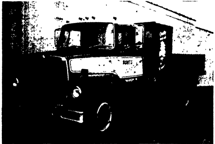
Sold to Roots Nurseries, Inc., Manheim, Pa.

SEE THIS TRUCK AND OTHER QUALITY PRODUCTS SOLD BY FARMERSVILLE EQUIPMENT, INC. ON DISPLAY AT SOLANCO FAIR - SEPT. 17-19, 1986