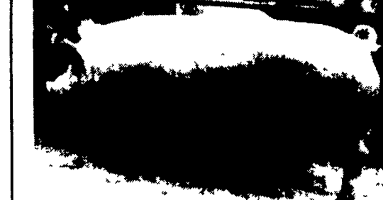
L.W. Bred Gilt

* Guarantee on Bred Gilts- All L.W. & Land & L.W. X Landcross Bred, Bred Gilts are guaranteed to farrow at least 8 pigs. All Duroc Bred Gilts are guaranteed to farrow at least 6 pigs. * Mr. Commercial Man- If you have not used L.W.'s you need to, 80% of the Large Whites will farrow 10 to 14 pigs, the other 20% will either be above or below. (And they can raise them). (Bred Gilts are a cheap way to buy Boars & Gilts for the Future). * SPECIAL ATTRACTION- Many of the L.W. Bred Gilts are carrying services to SYY King David 46-4 6.2 L.E. .78 B.F. one of the very, very best young L.W. Boars in the country. * SPECIAL ATTRACTION- Many of the Duroc Boars and Open Gilts are sired by (Nails). Nails was the Premier Sire at the 1986 Ohio State Fair. He sired the Grand Champion Boar & Reserve Champion Spring Gilt, plus several other class winners. That will sell in this sale. * SPECIAL ATTRACTION- We will offer 6 free breeding privileges at the sale to our new Duroc Boar, (Ten Grand).