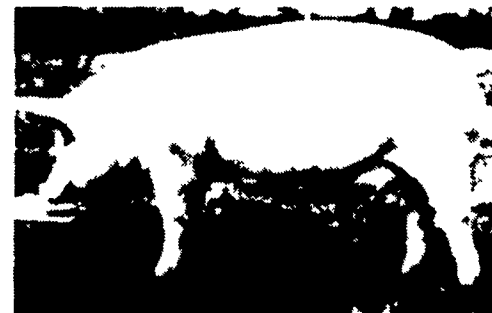
Pennsylvania's Record Selling State Sale Bred Gilt

Handmated - due October. Mostly sired by & carrying service to top test station boars. Bred for purebred and crossbred litters.