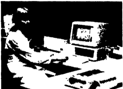
NIR provides fast and accurate forage results.