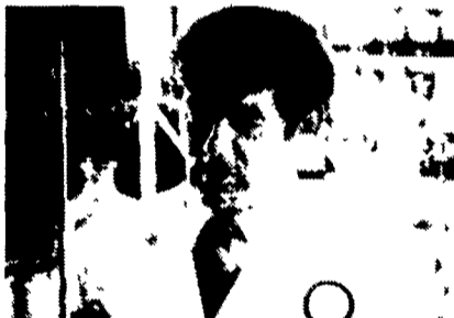
Wet chemistry is used to insure NIR accuracy.