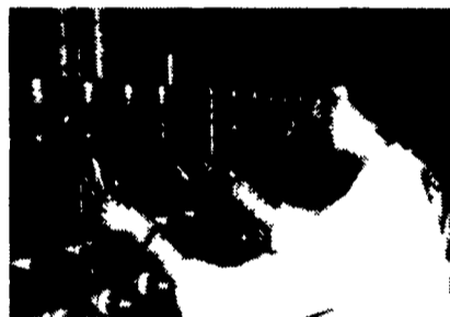
ADF (acid detergent fiber) and NDF (neutral detergent fiber) are used to determine available energy from forages.