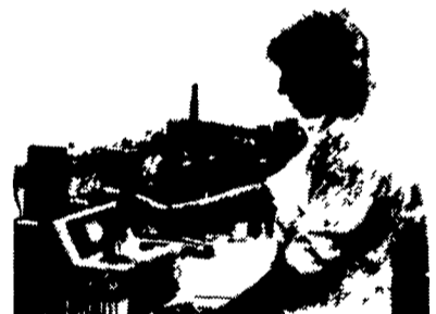
Forages and water samples are checked for the presence of nitrates when requested.