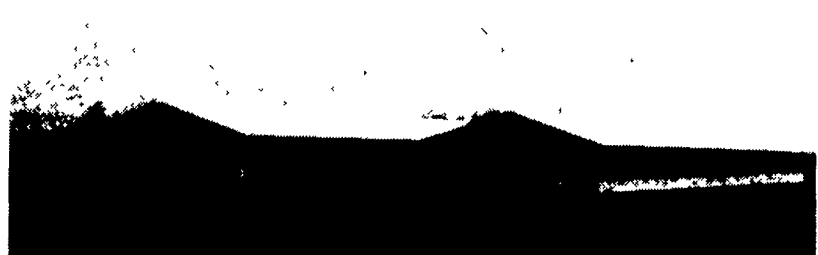
2 Story Turkey Houses