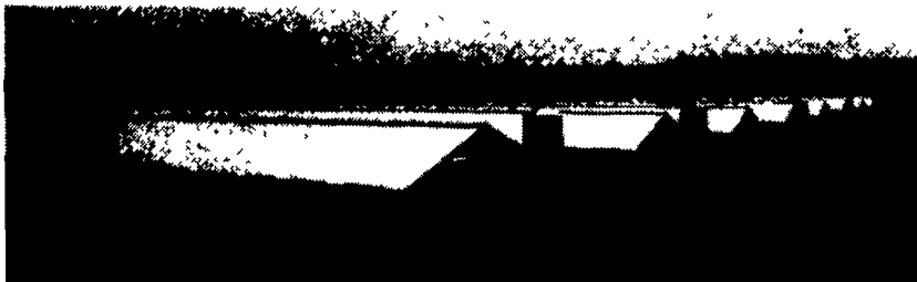
Single Story Turkey Houses