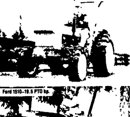
Ford 1510-19.5 PTO hp