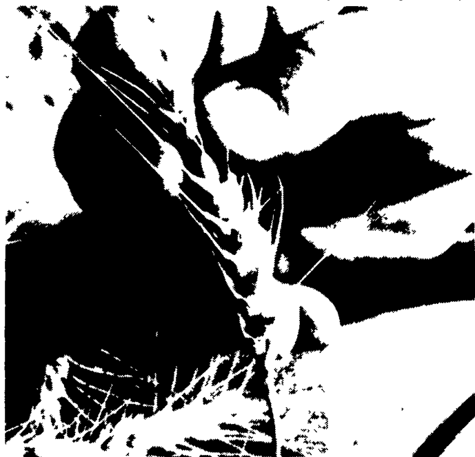
Long heads with four grains in each mash or section top a new wheat variety that combines excellent defensive traits such as strong straws and disease tolerance with high yields.

"Common sense also says to spread out risk and maturity by planting more than one wheat variety. Making 2551 part of a package of wheats makes economic sense, too," Fleet says.