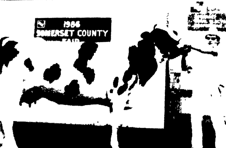
Paul Carr placed in the reserve grand champion position of the 4-H and open shows.