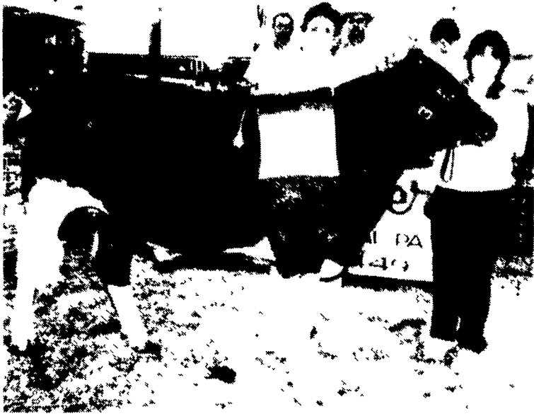
The grand champion market steer at the Union County West End Fair belonged to Crystal Knechel. D. Roger Shuck, representing Mifflinburg Farmers Exchange Inc., purchased the champion.