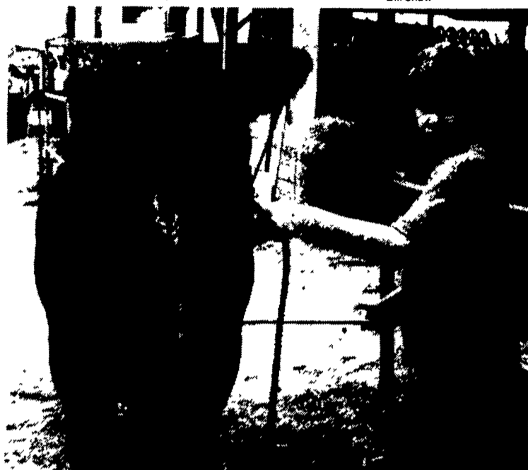
The grand champion market steer, a 1,205-pound Chianina cross, was exhibited by Heath Lilley of Donegal.