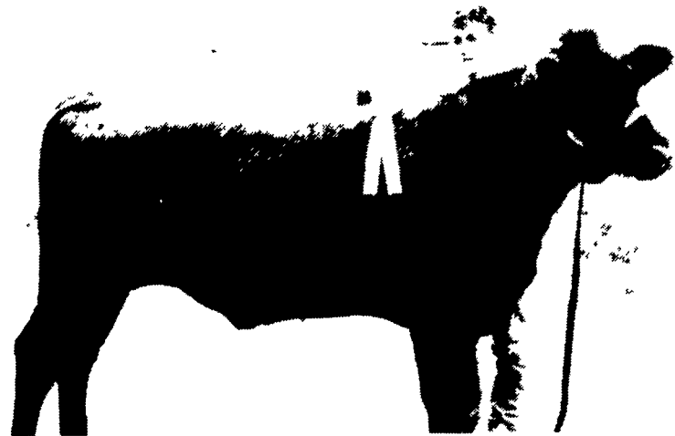
Grand champion showman, Lori Rabenold, poses with her steer, the champion middleweight in the market show.

the one that keeps rolling when others quit!