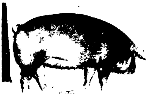
Champion Duroc bred gilt