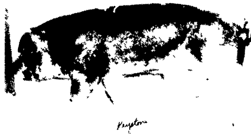
Champion Duroc boar