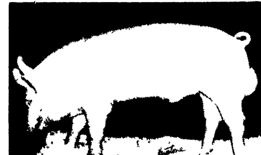
Champion Yorkshire boar