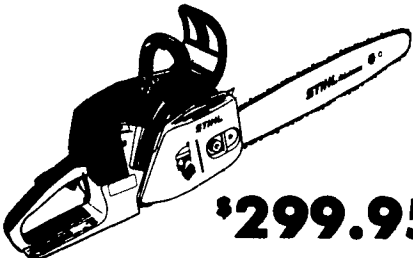
024 WOOD BOSS • 2.6 C.I. 10 lbs. 16"