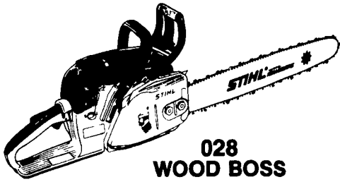
028 WOOD BOSS