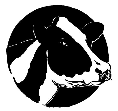
FRESH & CLOSE COWS & HEIFERS