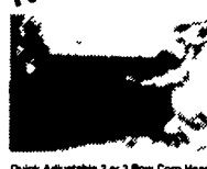
Quick Adjustable 2 or 3 Row Corn Head