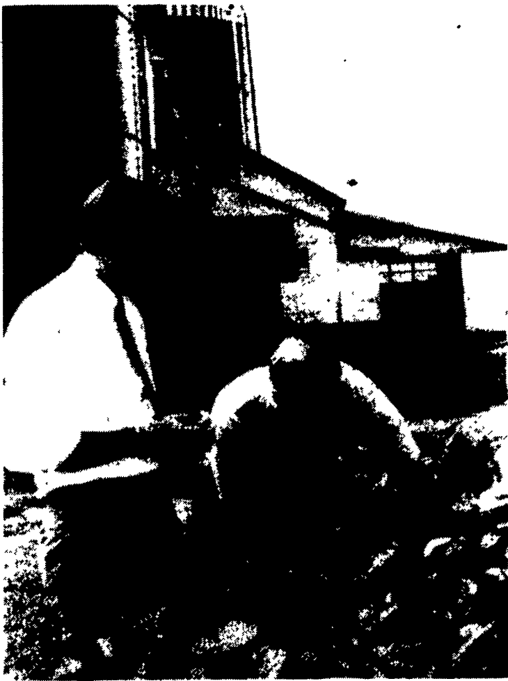
Scranton and Hoffer examine good soybean crop.

"Our agricultural community and state government should work together to assure that our products continue to hold center stage," Scranton added. "By working with the Export-Import