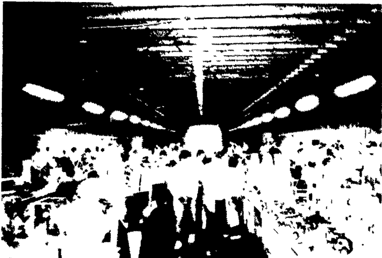
Many farm toy enthusiasts visited the 65 display and sale tables.

member farm toy club, said he expects about 400 older farm toys for this event, including some rare toys from local collectors, plus those being consigned from the mid-West.