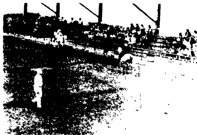
In the Ag Arena at Penn State, Arabian horses paraded for the horse judging contest.