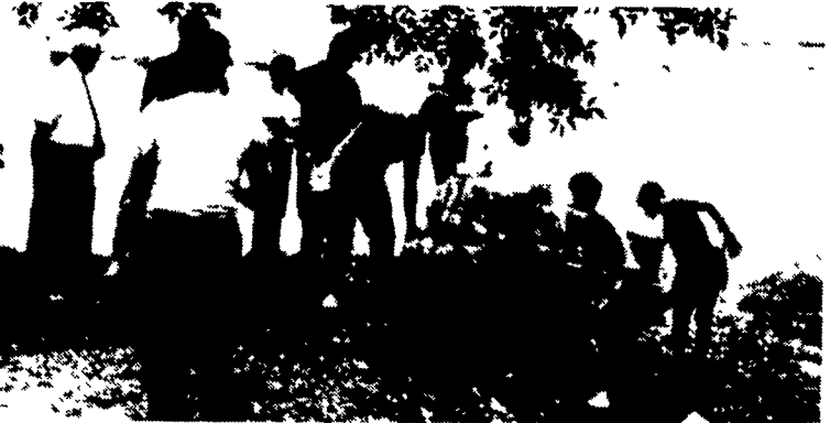
The Western Berks 4-H Dairy Club milk carton boat entry, the Milky Whey, was the award winner for the high milk carton count with a total of 692 cartons.