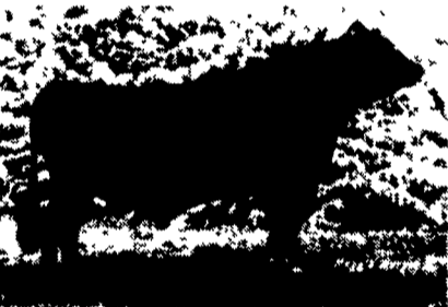
8J240 PALmer Fascinator George