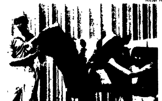
Fop Ayrshires in youth show were