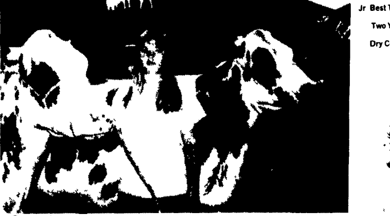
Open dairy show's top Ayrshires were shown by owner Carl Sandel, at right with reserve. Jenny Cromis holds grand champion