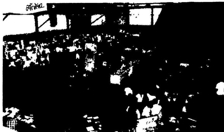
More than 4,500 square feet of exhibit space featuring a "wooly wonderland" of lamb and wool-related crafts, garments, pottery, yarns and fleeces was seen at the three-day Lamb and Wool Festival held recently at Penn State University. Exhibitors hailed from Maine to Kentucky.