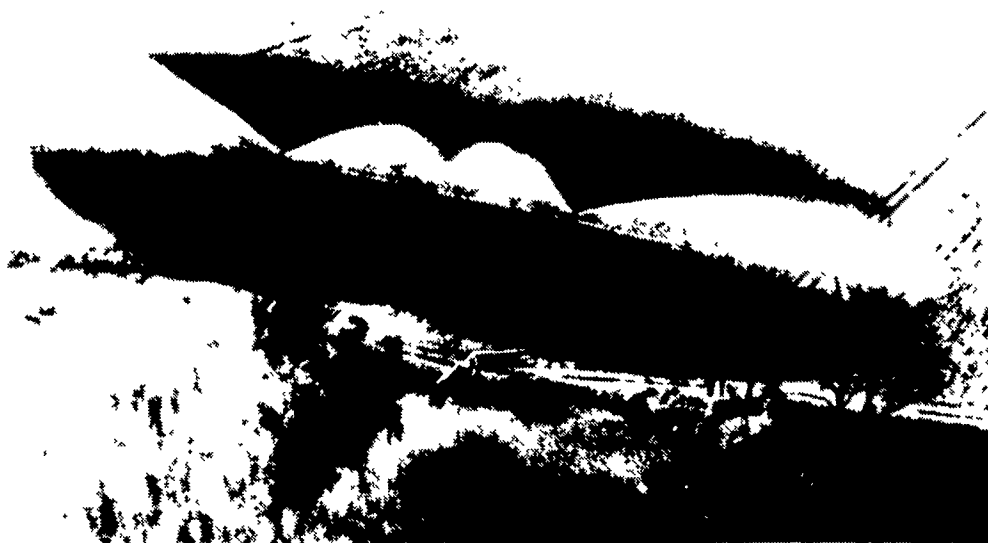
Giant sprinkler installation covering five acres.