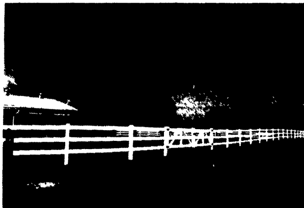
3-Rail Fence w/Gates "Never Need Paint" P.S. Polyvinyl will not rot, splinter, chip, etc.