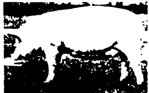
Pennsylvania's Record Selling State Sale Bred Gilt

Handmated - due August 13th thru September. Mostly sired by & carrying service to top test station boars. Bred for purebred and crossbred litters.