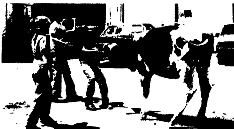
Participants in Berks County's field day encountered an unexpected game of tug of war while sharpening their showmanship skills.