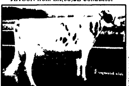
ERIC-DEW CONDUCTOR PEGGY EX(93)2E 6-6 365d 30,519M 4 3% 1,295F Cow Index 1/86 +821M + 05% +39F +$113 Backed by EX(90)GMD with 33,000M 1,165F and 130,000 lbs milk in 5 lactations Next dam over 202,000 Peggy's JETSON heifer sells Consignor Peggy Syndicate, Juniper Farms, Gary, ME