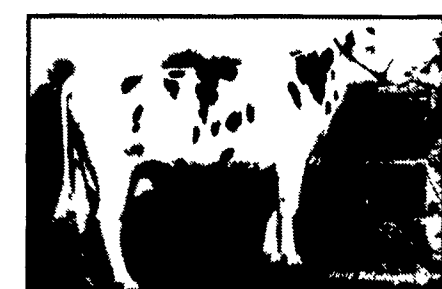
LA POE MARS HONNOR EX(91) EEEE 4-2 365d 36 190M 4 2% 1,529F Cow Index 1/86 +1502M + 02% +57F +$183 She has 100,000M of 4 1% in 3 lactations Grandam is an 83 point Glendell with 25,700M 1,044F Consignor Honnor Roll Syndicate, Clare. MI

Ravena's April NED BOY daughter sells Ask about the SUPER COW SWEEPSTAKES Consignor Briarpatch Ltd , Mike Rainey Eatonton GA