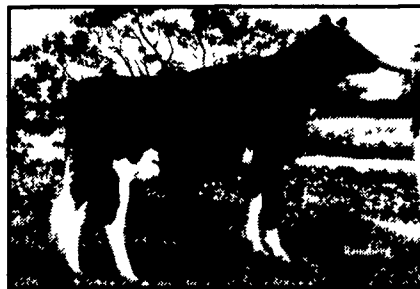
ART-ACRES MARBETH KAY U-ET VG(88)EX-MS 2-3 346d 22,330M 3 5% 789F Cow Index 1/86 +1258M - 05% +35F +$132 KAY-U topped the 1985 Sire Power Sale - $25,500 Grandam is ART-ACRES Elevation Kay EX(91) with Consignor Arthur Rhoderick, Hagerstown, MD