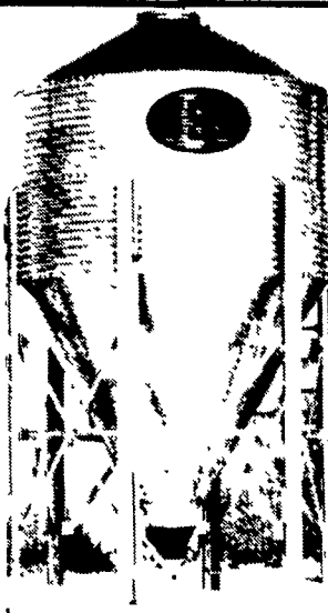
GSI FEED BINS From 2½ Ton To 150 Ton