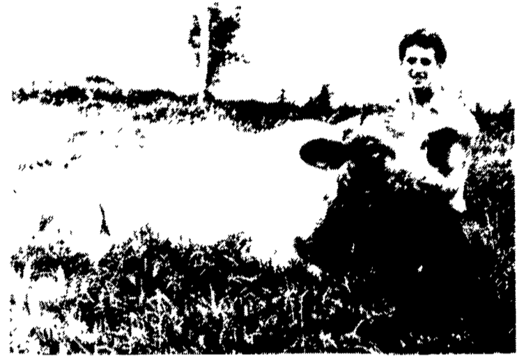
Although "Julia" died in March last year, her family continues with "Jewel," a just fresh Admiral daughter.

class leader in 1984 with a 3-year-old record of 20,073 pounds of milk and 1,102 pounds of fat.