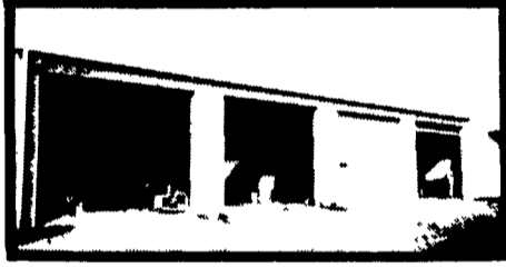
SHOP - STORAGE - GARAGE