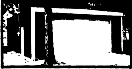
FARMSTEAD® II GARAGE