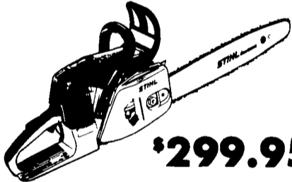
024 WOOD BOSS • 2.6 C.I. 10 lbs. 16"