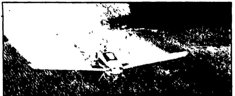
AERIAL APPLICATION IS NOW AVAILABLE TO THE LEHIGH VALLEY AREA

SPRAYING - SEEDING - FERTILIZING PESTICIDES - HERBICIDES ALFALFA - SOYBEANS - SWEET CORN