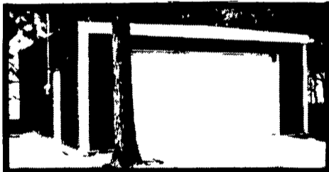
FARMSTEAD® II GARAGE