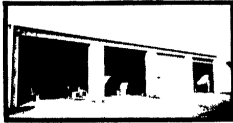
SHOP - STORAGE - GARAGE