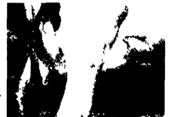
2 Yr. Top Uddered Jet Stream 60 lbs.