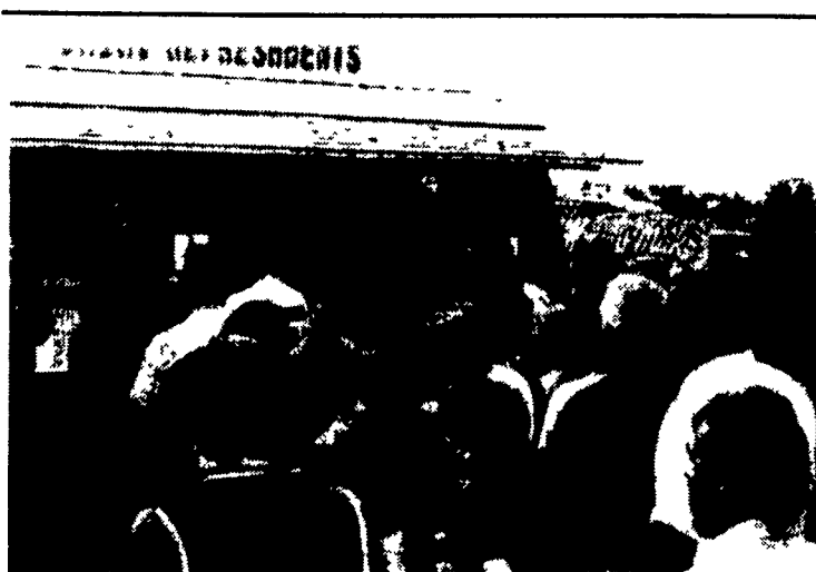
Give me a shake. People wait in line at the Buck Tractor Pull.