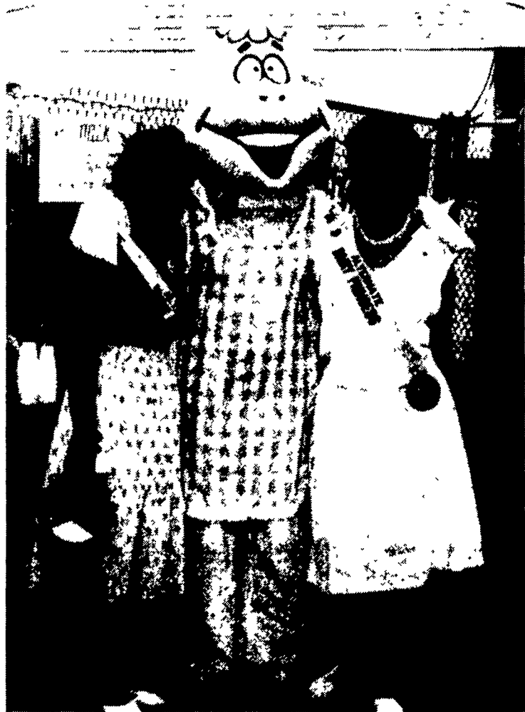
The pink cow and the princesses.