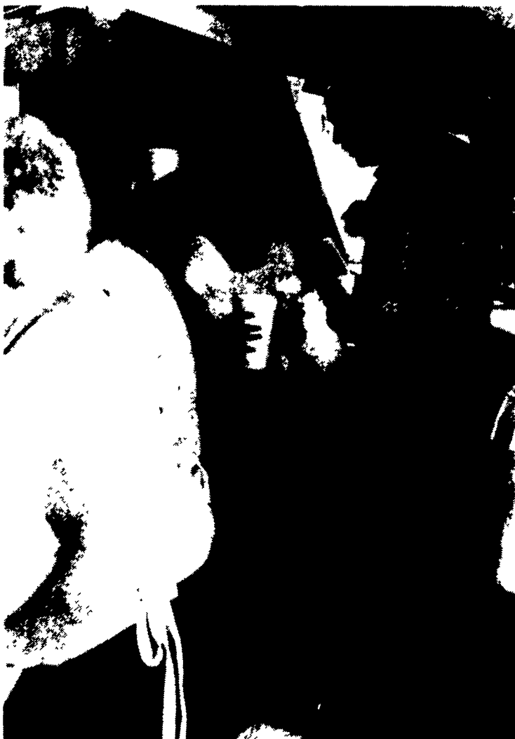
Workers at the milk shake stand were crowded and busy all night.